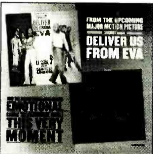
K-Ci &amp; JoJo

Beyoncé Knowles' sister Solange goes for adds at Rhythmic and Urban next week with "Feelin' You," featuring N.O.R.E., the lead track from her solo debut, Solo Star . The young star has already made her mark in the entertainment industry, having been featured in many magazines for her style sense and having hosted the first MTV TRL tour in 2001 and written and produced tracks for Kelly Rowland's debut album, Simply Deep .