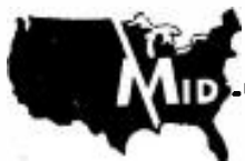
HOOPER RADIO INDEX—7 AM-6 PM, MONDAY-FRIDAY, OCT.-NOV., 1954

** The MID-CONTINENT FORMULA brought WTIX from 11th to 1st in 10 months. First all-day (21.3%), second station, 17.9%, (Nov., 1954 Hooper).