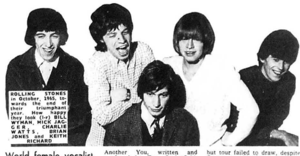
World female vocalist

rilla Black and Righteous Brothers, won by the latter who got to No. 1, after Moody dues topped with Go Now. No album, Rolling Stones No. 2, and Stones in Australia.