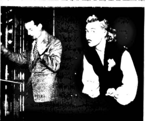
Exclusive Musical Express picture of Betty Hutton, seen here with Woolf Phillips, conductor of the Skyrocks, during her recent visit to London.

treats it for what it is and glisses and slurs all over the place, and makes liberal use of what might almost be described as "blue notes." The result is quite disarming and very exciting. "Blue notes" is a more restrained piece in tango rhythm, but treated in the modern idiom.