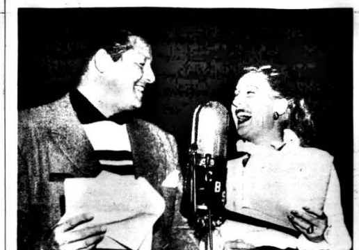
Comic Jack Carson and singing star Marion Hutton romp rapturously through CBS's new "Jack Carson Show".