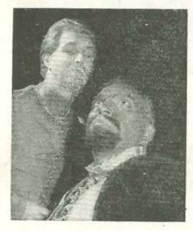
Iggo and Othello

Othello is generally regarded as of all Shakespeare's great plays, the one most nearly conforming to the "classical unities." It is close-knit and cleverly constructed, though less rich in poetry than the other great tragedies - Macbeth, Lear, Hamlet and Antony and Cleopatra - produced in his period of "dark vision," from 1600 to 1608. Lear, Macbeth, and Antony are drawn against the broad tapestry of nations in conflict; Hamlet and Othello are more personal, with circumstances, leading inevitably to