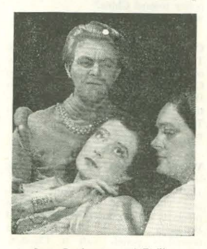
Iago, Desdemona and Emilia

an element in both plays. Hamlet's ship is attacked by pirates, and he returns to Denmark; Desdemona drops