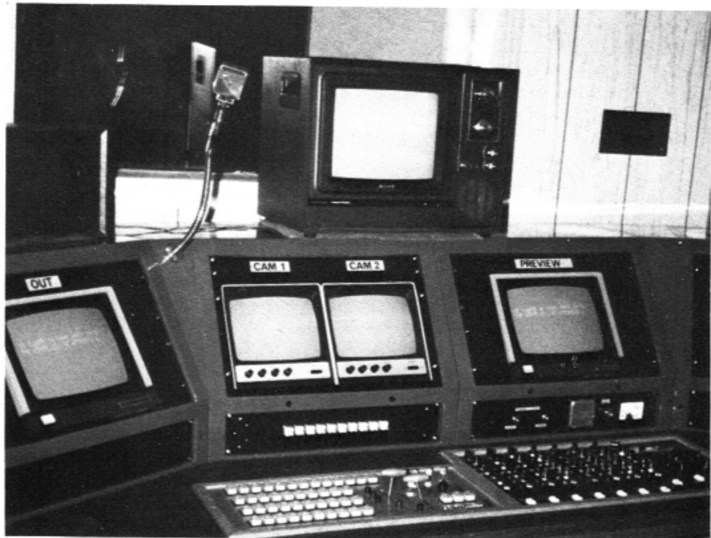
A comprehensive studio and mobile facility was recently supplied and installed for Shellbird Cable Ltd. , by DGH Television Systems Ltd. The local origination facility is for both color and monochrome production, and includes post production capability. Shellbird, which serves the Corner Brook, Nfld., area, became operational early this year.

● The 1978 Canadian Education Showplace has been cancelled. The 14-year-old trade show is "indefinitely postponed until market conditions improve".