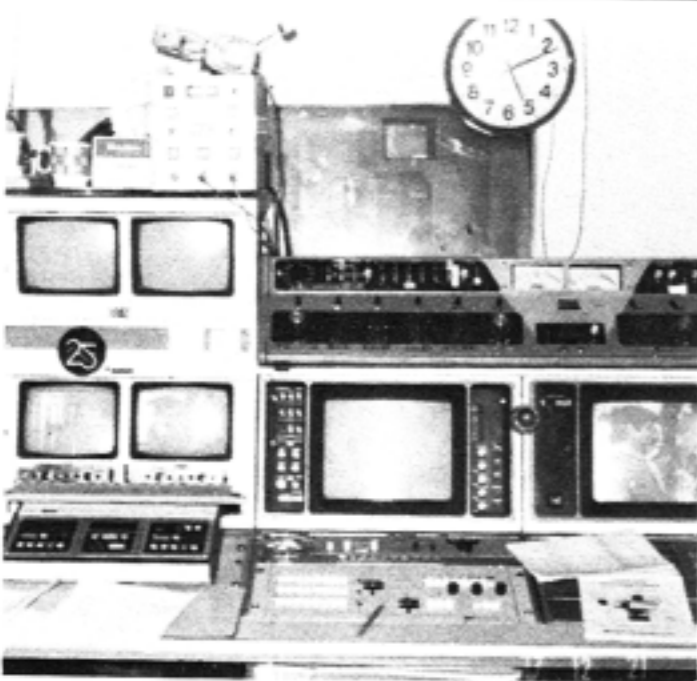
Although CFLA-TV Goose Bay, Labrador, went on the air in 1956, local origination color capability was added only recently. Photo shows refurbished control room, looking into studio, now equipped with Hitachi FP 1212B and portable SK80 color cameras.

● ABC-TV in Hollywood are now using two Canadian-made 12-channel portable mixing boards for mobile operations such as the PGA golf tournaments. Supplied by Richmond Sound Design Ltd. of Vancouver, the M8S-B was selected for its gain and headroom, among other features.