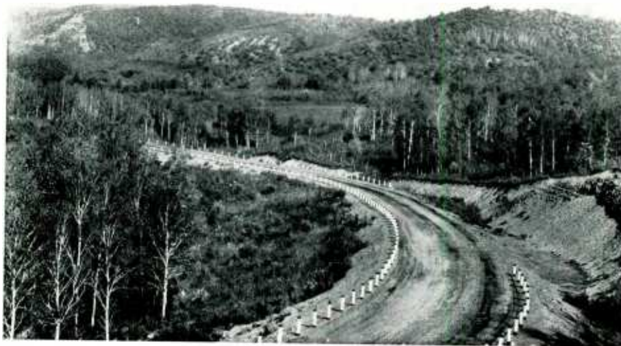
Highway west of Morden.