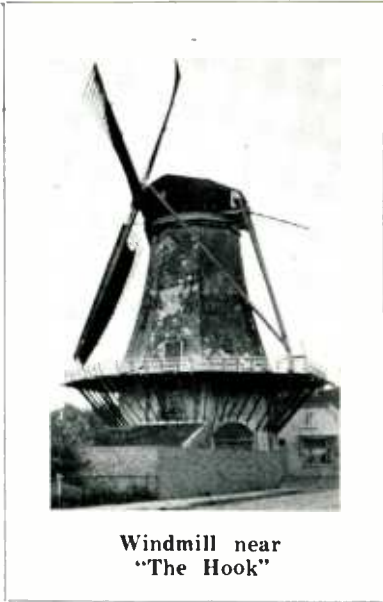
Windmill near "The Hook"