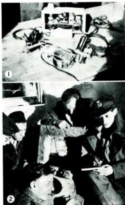
Upper: Miniature but efficient radio receiver, smuggled into German prison camp. Lower: Radio was concealed in a butcher's block which was hollowed out.

A flare signal from an aircraft was seen to drop slowly to the ground. That signal was the German Commandant's order to start a forced-march of the 12,000 prisoners of war toward central Germany. Notice was given that the march would start in half an hour. Each man felt a sickening emptiness inside, as the hope of freedom quickly vanished. A few personal belongings were packed—that picture of a loved one, or a small reminder of days gone by. Treasured books had to be left behind. They could be replaced. Every ounce of food was packed. Food was necessary for survival. At that time each man's personal problems seemed to require the scope and magnitude of international significance and the radio—well, it was forgotten—but fortunately, not by everyone!