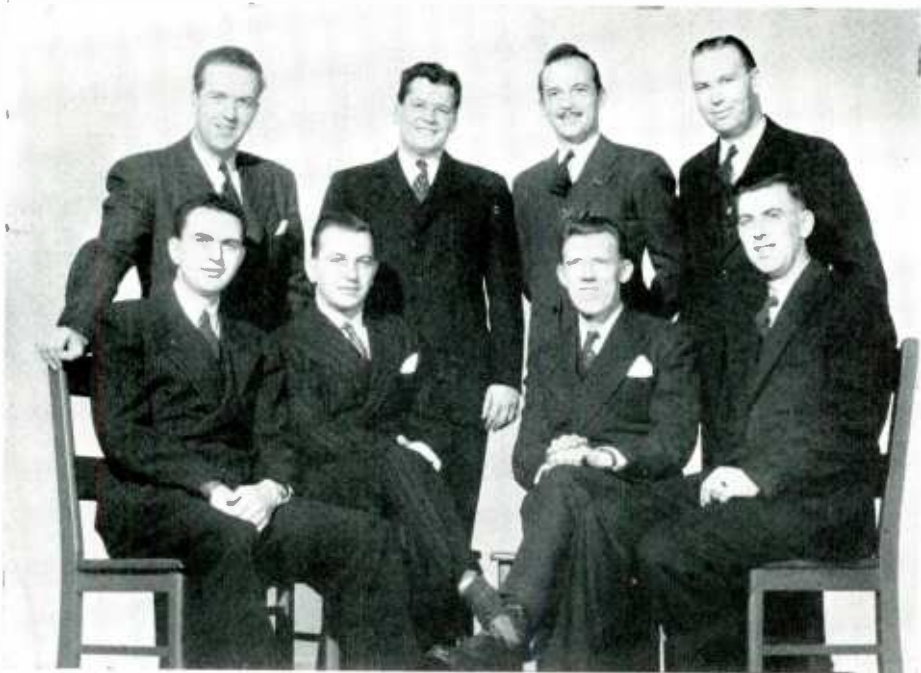
Heard in "Jolly Miller Time", sponsored by the Maple Leaf Milling Company, on CKY Wednesdays at 7.00 p.m.