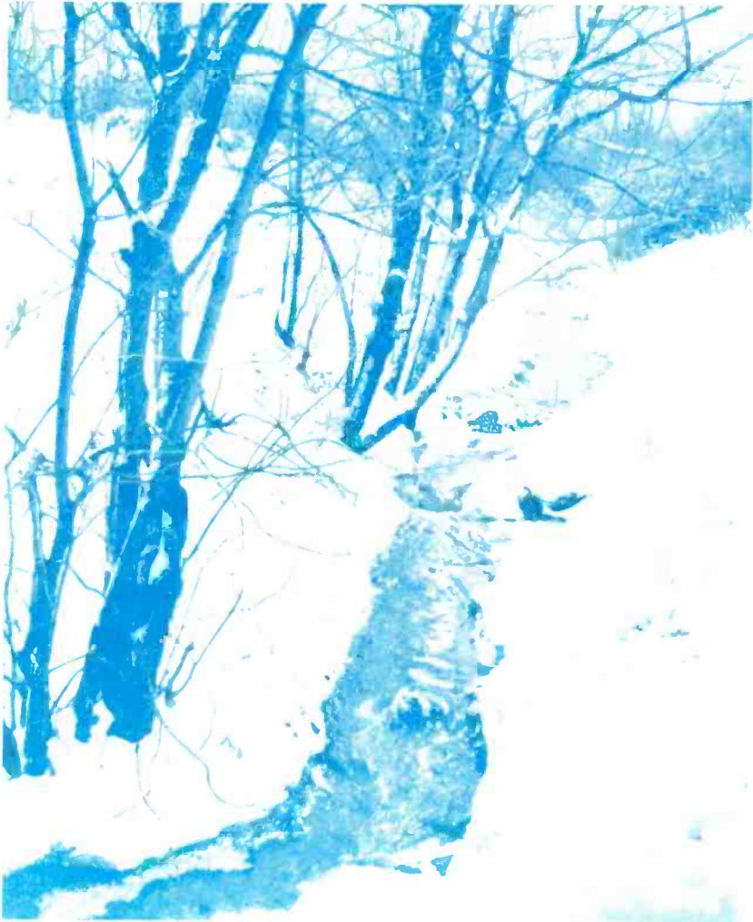
The Swelling Brook