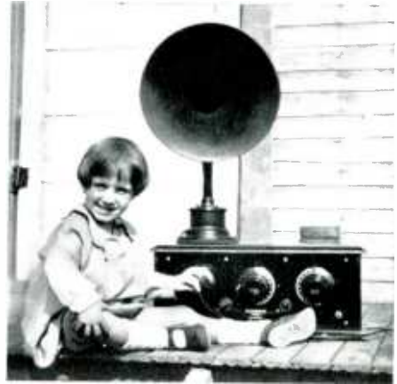
Radio Receivers looked different in 1927