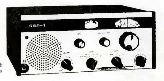
DRAKE'S SSR-1 RX

encies from 500 km2 to 50 mm2, Selectivity of the new SSR-1 was not mentioned in the brochure provided me, but judgeing from other Drake equipments, it will probably come with a fixed crystal filter of approximately 6 kHz at 60 db and below and 12 kHz at 60 db and below. Although it is only sneculation at this point, experience with other Drake equipments would suggest that optional filtering may be available, i.e. 2.4 kHz at -6 db and 4.0 kHz at-60 db... a much better arrangement. The likelihood of this option will be reported as soon as none