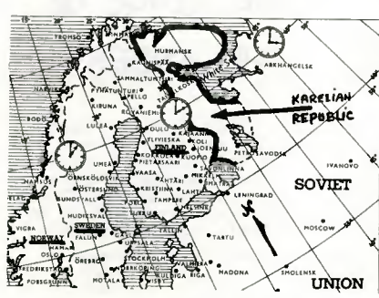
by Carroll (Pat) Patterson

As a parting tip: Try 7175 and 7245 around 1100 GMT or later. Can you hear oriental talk and music? Perhaps you have heard VTVN Saigon.