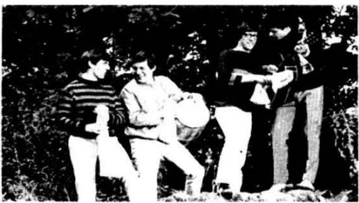
THE SHADOWS — in a shot from 'Finders Keepers'