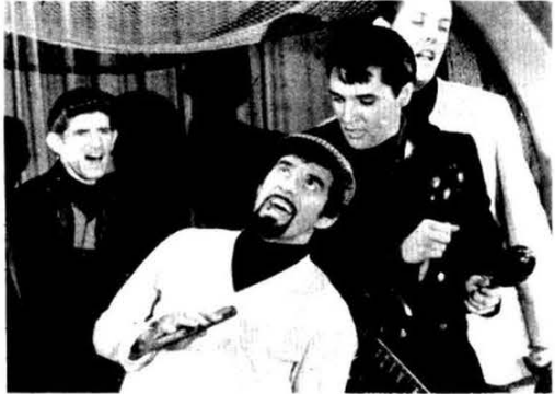
ELVIS in a shot from "Easy Come Easy Go", during the middle of a comedy number with some of his mates

ELVIS PRESLEY has appeared in just about every setting during his long and energetic film career. Now, in "Easy Come, Easy Go", he goes underwater! All part of a search for buried treasure and he gets involved in fights and he suffers a little disillusionment when the coin-laden chest is finally brought to the surface. Which is a short précis of this new movie, released in the next few weeks by Paramount here. And it's also a guide that this is Elvis back to his swashbuckling, tough-edged best. Not that I've anything against him when, as recently, he's been rather softer and more sensitive. It's just that those body twitches and heftily shrugged shoulders and positive actions are more HIM, if you see what I mean.