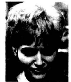
SANDY POSEY