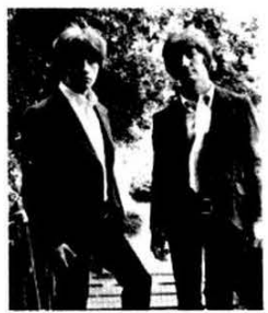
TWICE AS MUCH