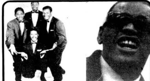
THE COASTERS — their biggest hit re-issued. RAY CHARLES — his fantastic "What I'd Say" on one side of a single!