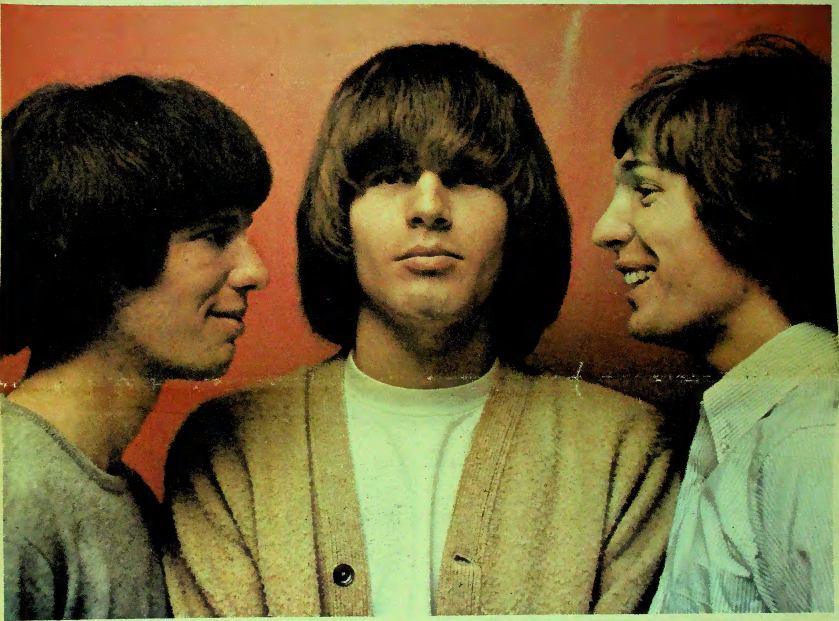
THE WALKER BROTHERS topping the charts this week, Currently their