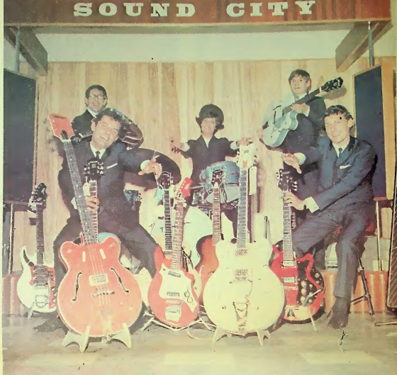
THE HONEYCOMES - with the fastest rising group hit in the shape of "Have I The Right,".