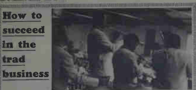
*THE SWINGING DUTCHMEN—'phenomenal!'

OVER the years, since they made their British debut in 1949, the men of the DUTCH SWING COLLEGE band have played in this country often enough to build up ady of faithful followers.