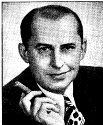
Ben Bernie "The Old Maestro"

His "Yowser, Yowser" made familiar to millions of radio listeners by years of broadcasting with his orchestra, Ben Bernie is now extolling the merits of Bromo-Seltzer in a series of spot announcements, carried by CKY. Unique in phrasing and in styling of presentation, these spots effectively combine entertainment with advertising in a manner which suggests new possibilities in direct appeal by radio.