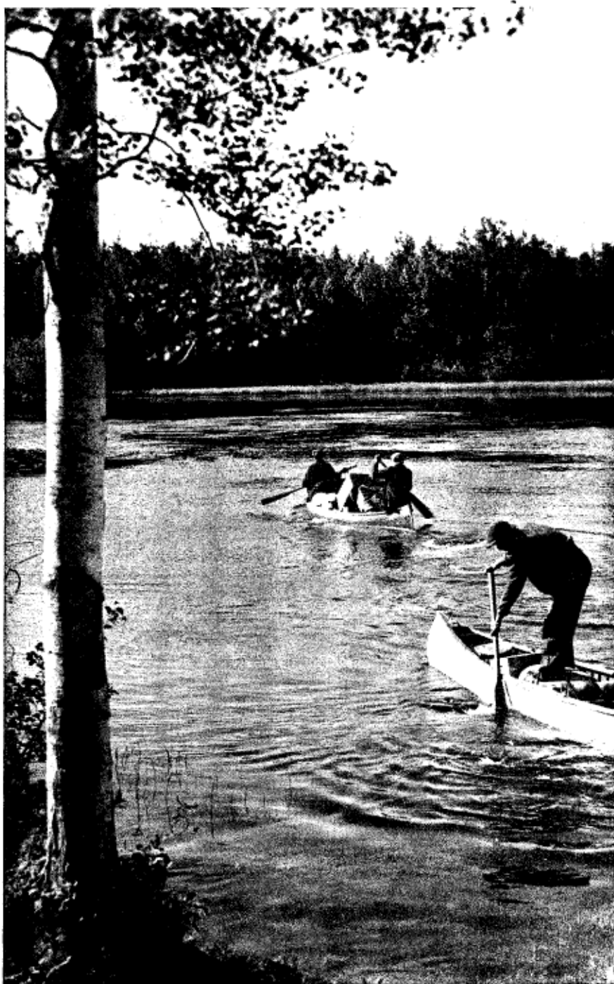
Freight Canoes in Northern Manitoba