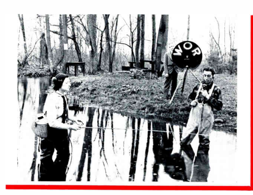
Broadcasting the opening of the trout season in New Jersey