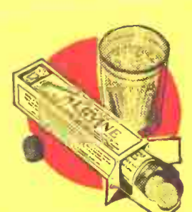
Dr. Miles Nervine

on the Nerves as Dr. Miles Liquid Nervine. Being alkaline in reaction, they tend to correct the overacid condition that frequently causes Nervousness.