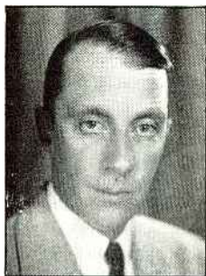
Graham McNamee National Broadcasting Company WEAF-WJZ New York City

A ND, we might add, of The World! For wherever radio has gone Mac's voice has gone with it and his watch chain is heavy with the keys of the country's important cities, bestowed on him by admiring mayors. When Mac goes to a town to make a personal appearance the entire population turns out to welcome him and yet there is no more modest celebrity in the country than this NBC star who looks on every broadcast as just another chance to make his best, better!