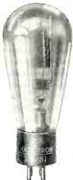
UX 281 Half Wave Rectifier