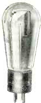
UX 280 Full Wave Rectifier