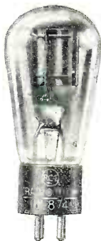
UX 874 Voltage Regulator