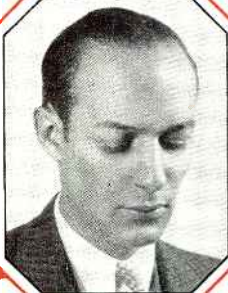
Ted Husing Columbia Broadcasting System WABC New York City

C OLUMBIA'S Big Boy and a close rival of Graham McNamee in the field of sports reporting, Ted is one of the youngest of radio's stars. He gallops through his arduous schedule with the enthusiasm of a youngster and to say "office desk" or "swivel chair" in connection with Mr. Husing would be like coupling an airplane and a tractor. Ted hits the high spots and what's more he brings the high spots home to the nation-wide hook-up of the CBS.