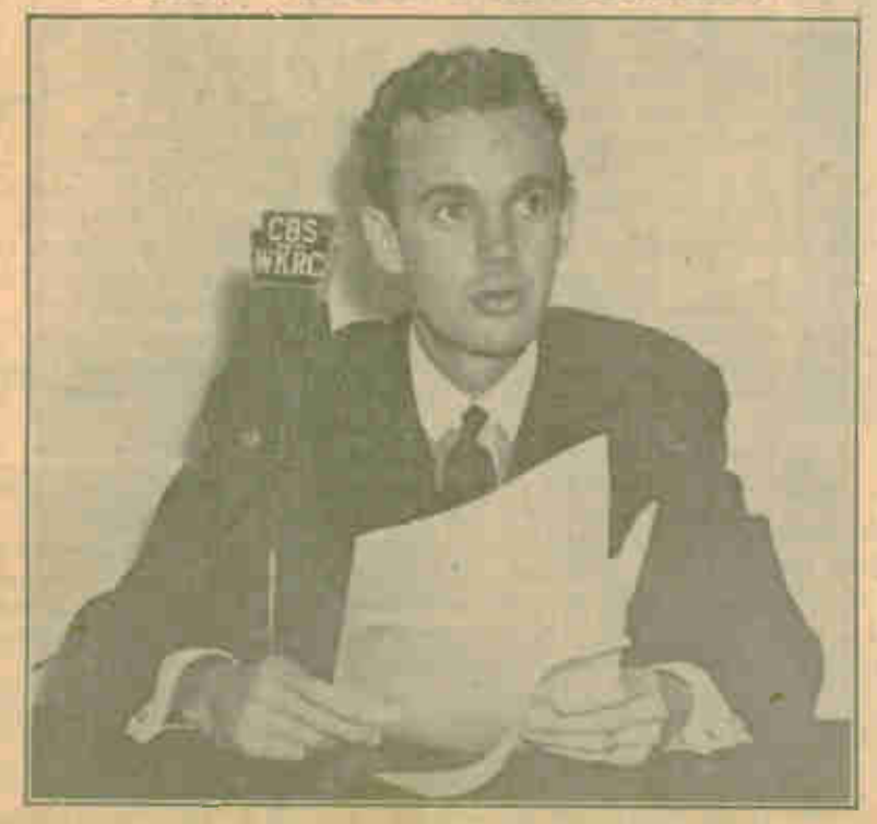
(See Page 4)