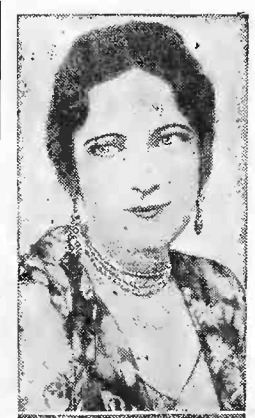
Peggy Wood, favorite of American and British light opera, will be heard as guest artist with Leo Reisman's orchestra in the Pond's program Friday (October 16) at 9:30 p. m., through WSAL.