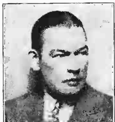
Featuring FRED ALLEN

Broadway's greatest comedian with an all-star supporting cast directed by FRANK BLACK