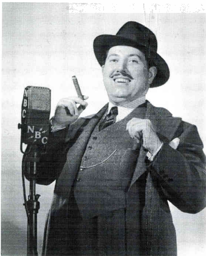
Hal Peary, "the Great Gildersleeve."