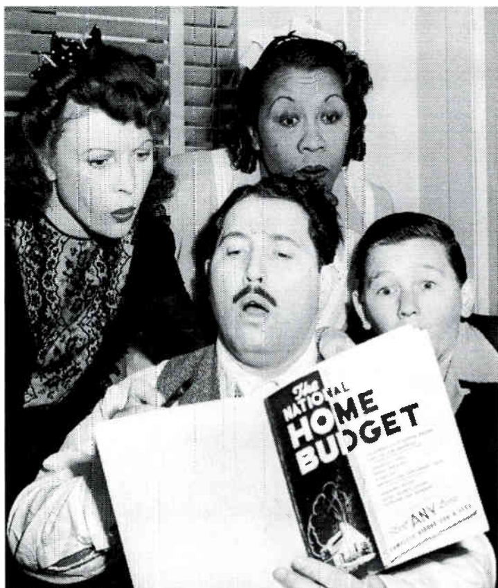
Marjorie, Birdie, Gildy and Leroy (Lurene Tuttle, Lillian Randolph, Hal Peary and Walter Tetley)