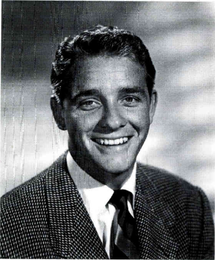
Richard Crenna as “Bronco Thompson.”