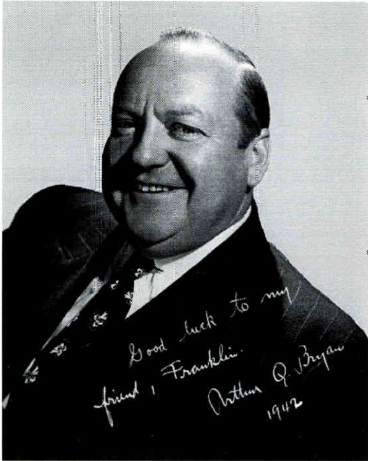
Arthur Q. Bryan as "Floyd Munson," 1942