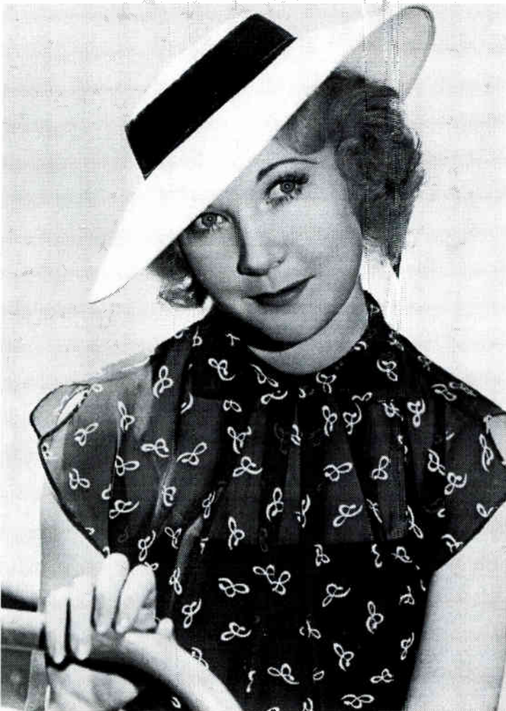
Una Merkel, "Adeline Fairchild."