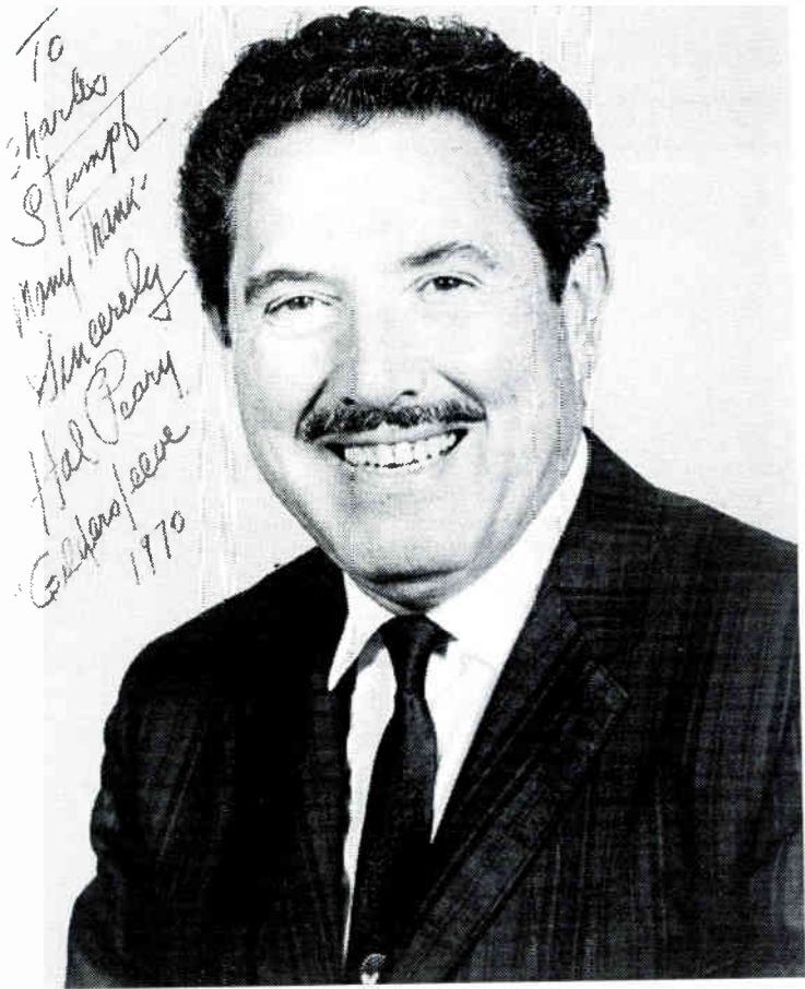
Hal Peary, the Great Autograph Signer.