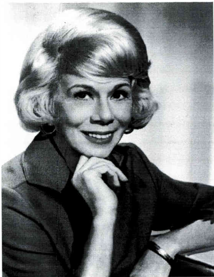
Bea Benadaret, "Eve Goodwin."