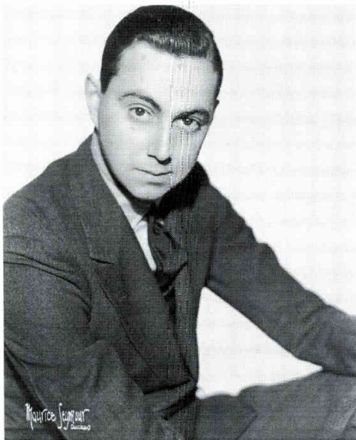
A young Willard Waterman, 1935.