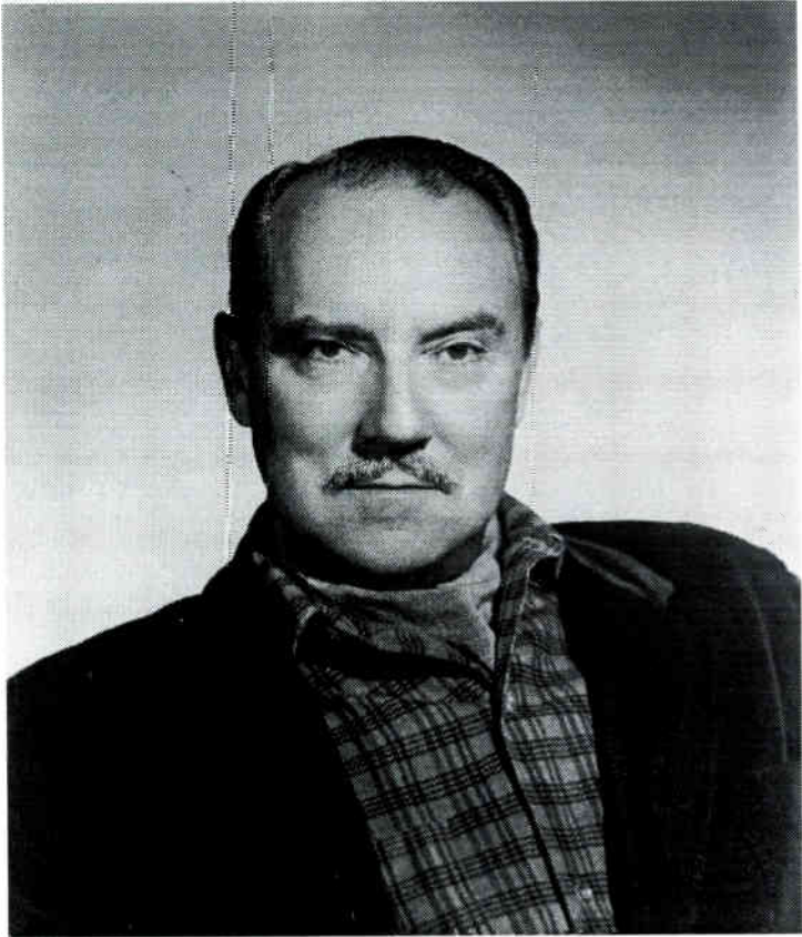
Gale Gordon, "Rumson Bullard."