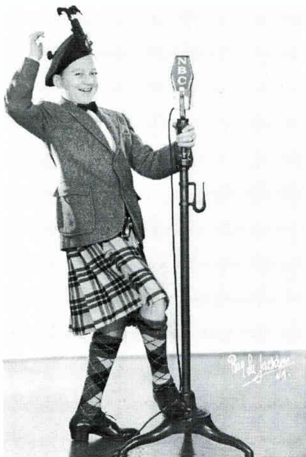
Walter Tetley as "Wee Sir Harry Lauder."