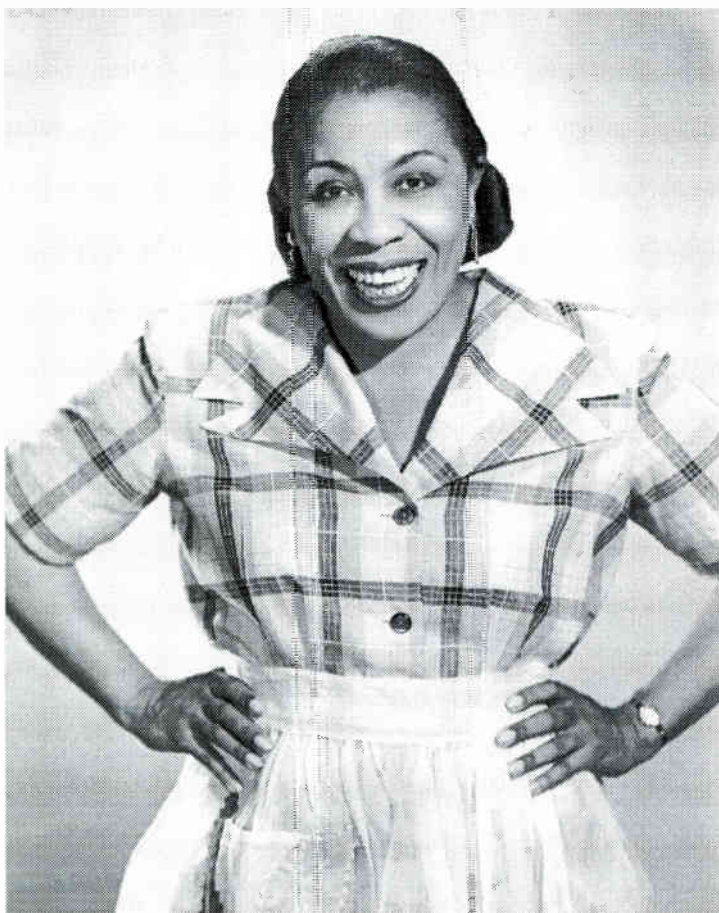
Lillian Randolph as “Birdie,” 1952.