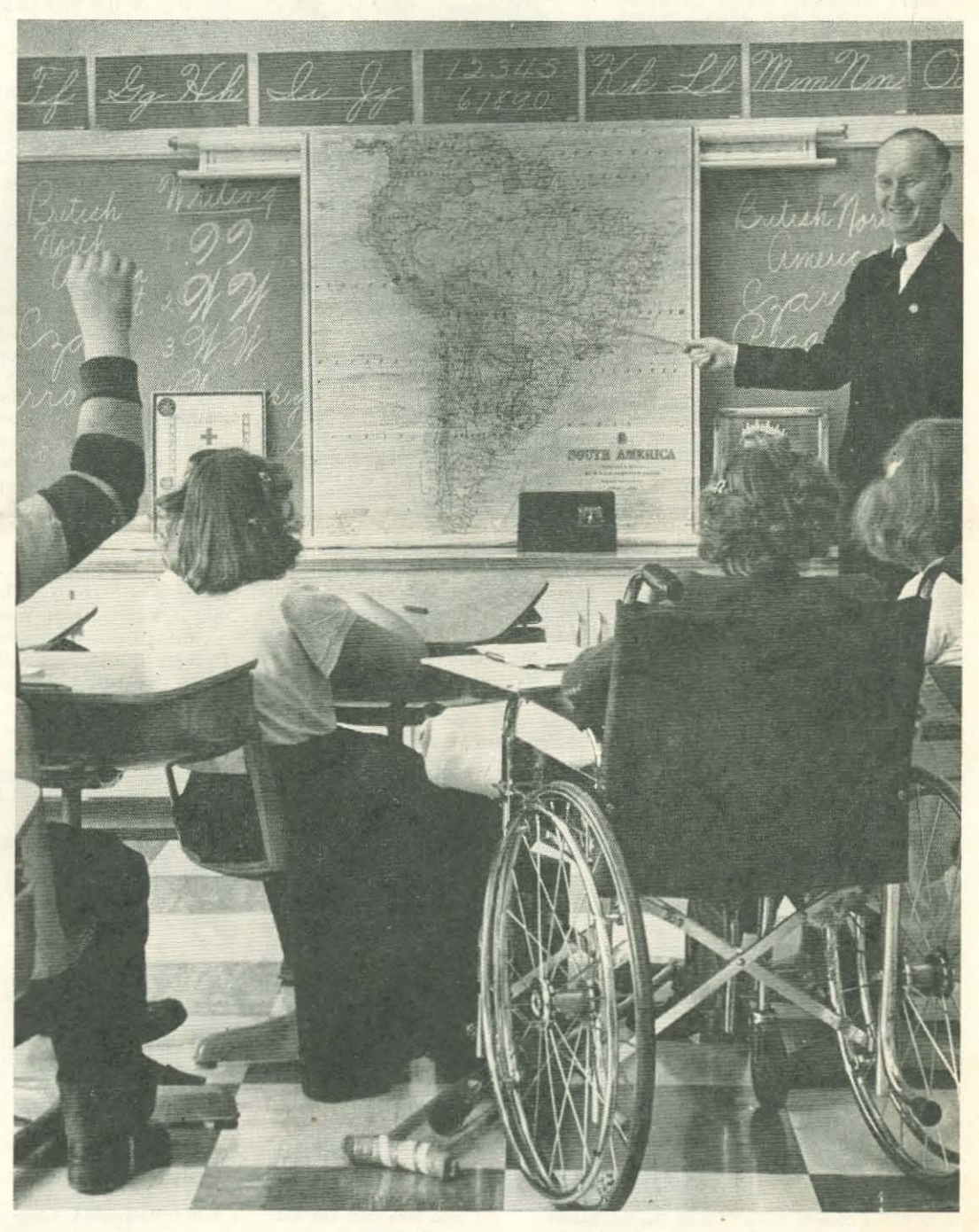
A Window on the World

The 1953-54 season will bring a number of in-novations, including TV programs to complement