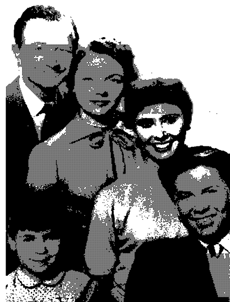
FATHER KNOWS BEST: Robert Young, Jane Wyatt, Eleanor Donohue, Billy Gray, Lauren Chapin.

The big studios looked down their noses at the efforts made by the "little guys" for the little screen. That was until a cartoon-maker named Walt Disney decided that the world needed another amusement park and that the