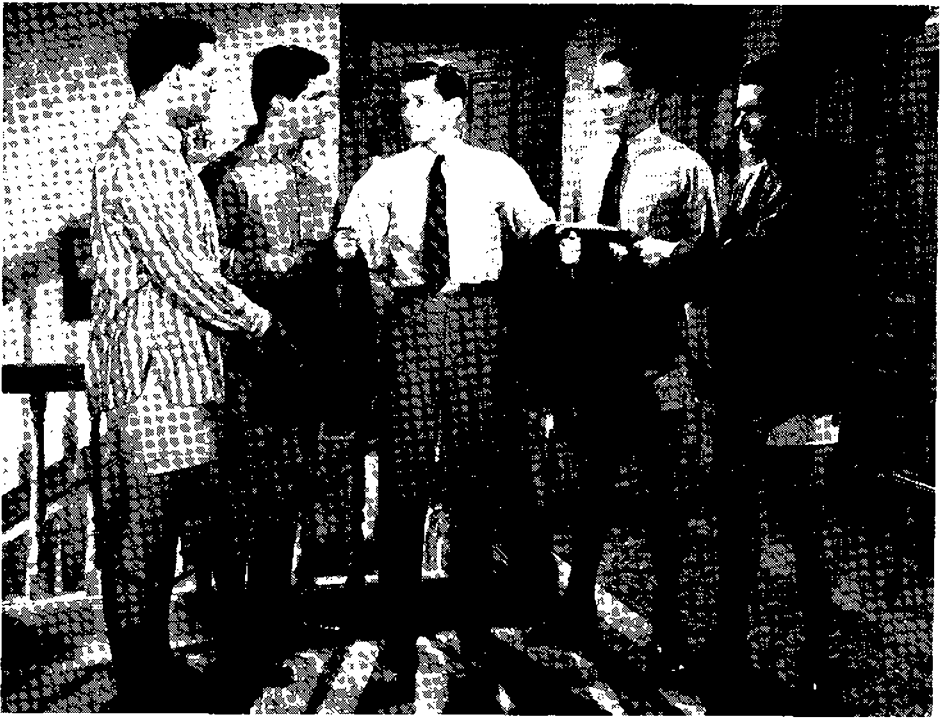
THE FIGHTING SULLIVANS were depicted on the motion picture screen in a 1944 Twentieth Century-Fox film. The movie was the true story of the five brothers who were killed in action when their ship was sunk in the South Pacific during World War II.

the U.S., from President Franklin D. Roosevelt down to ordinary citizens. The Sullivan Brothers and their sacrifice became a rallying cry for the nation at bond drives, war rallies, and on recruiting posters.