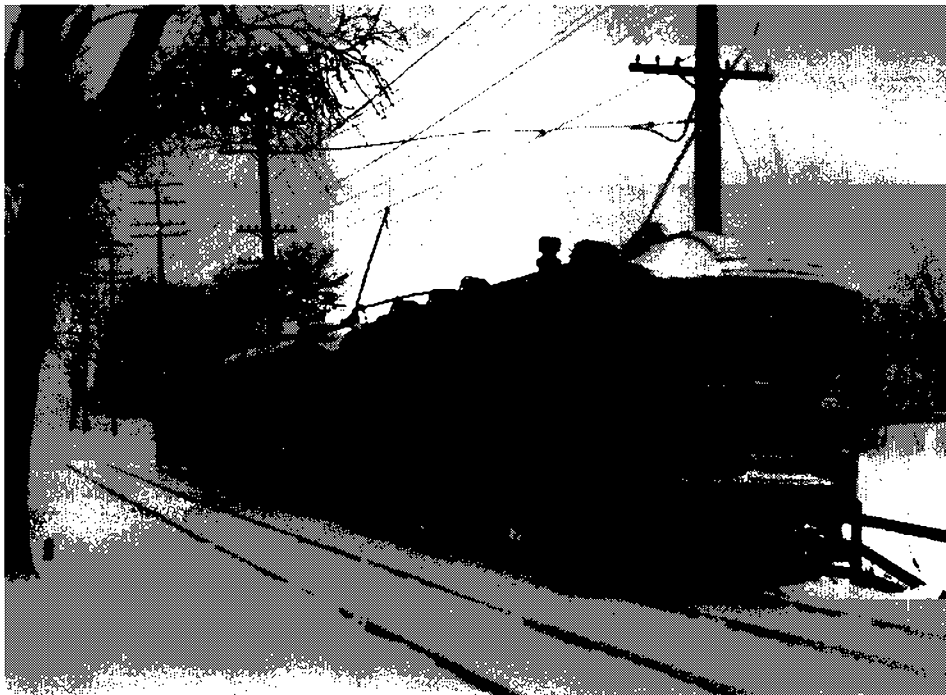
SNOW played an important role in the North Shore's fortunes every winter — but the trains almost always got through, as here along the Shore Line Route in Highland Park in February, 1949.