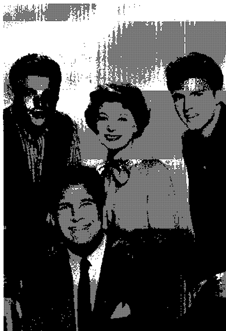
THE NELSON FAMILY: David, Ozzie, Harriet, Rick

Television would save the studio one more time.