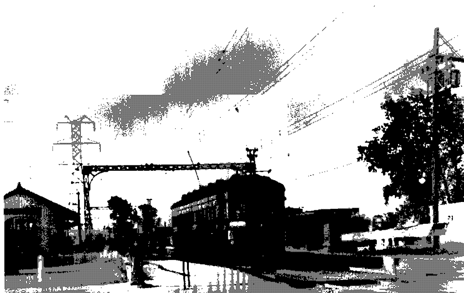
LIGHT TRAFFIC often called for the use of a single car, as here at Northfield on the Skokie Valley Route.