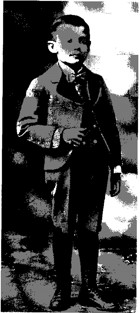
JACK BENNY, Age 4

reaching downtown Evanston in 1899 and Milwaukee in 1908. The Waukegan city system that formed the nucleus of the interurban was also enlarged, and a branch was built westward from Lake Bluff to Mundelein in 1905. In 1908 Chicago's 'L' system was extended northward to a direct connection with the interurban line in Evanston.