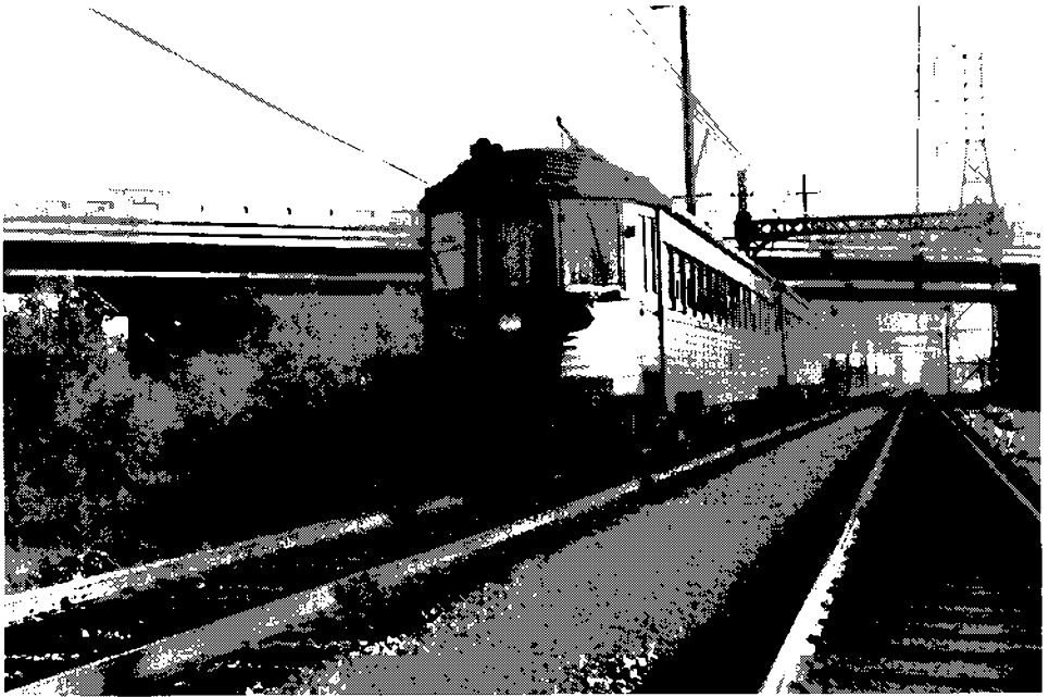
SKOKIE VALLEY ROUTE was a high-speed rail line that enabled the North Shore to lop precious minutes off its schedules — but the Edens Expressway overhead presages the end for this fine railway.

way several miles west of the lake in the Skokie Valley. The new line turned west at Howard Street, then north just west of Cicero Avenue (today's Skokie Highway), permitting a high-speed run through the prairies to what is now Illinois Highway 176 (Rockland Road). Trains turned back east along a part of the branch line from Mundelein to Lake Bluff and rejoined the older route at North Chicago Junction just south of 22nd Street.