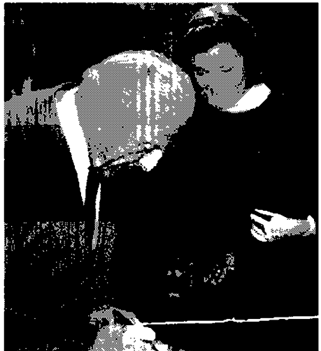
HIMAN BROWN signs an autograph for an enthusiastic fan as others wait for their chance to meet the man who created the CBS Radio Mystery Theatre.