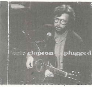
ERIC CLAPTON Unplugged Reprise - CDW-45024-P