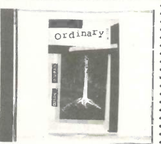
ORDINARY WORLD Duran Duran Capitol