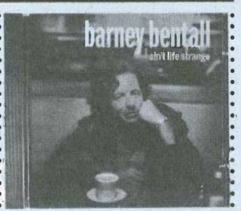
BARNEY BENTALL Ain't Life Strange Epic - EK 80173-H