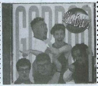
BARENAKED LADIES Gordon Sire/Reprise - CD-26956-P