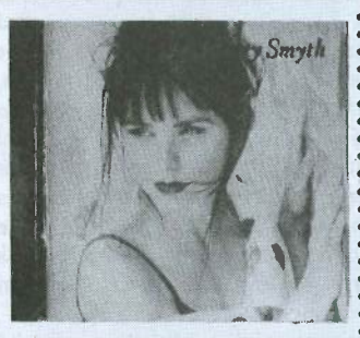
SOMETIMES LOVE JUST AIN'T ENOUGH Patty Smyth/Don Henley - MCA