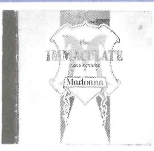
MADONNA The Immaculate Collection Sire - CD-26440-P

World On Edge have a European edge to their music. But after spending time writing and working on that continent, it would stand to reason. Now, these Virgin recording artists are back home, and making good headway with their self-titled debut.