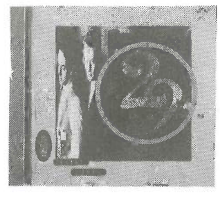
29 PALMS - Alternative/Pop Fatal Joy I.R.S. X2-13054-F