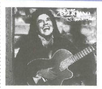
JOSE FELICIANO Steppin' Out Attic - ACD-1299-Q