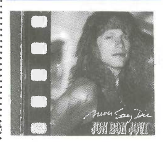
NEVER SAY DIE Bon Jovi Mercury