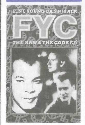
FINE YOUNG CANNIBALS The Raw & The Cooked IRS - IRS-6273-J

TROUBLE ME 10,000 Maniacs THE END OF THE INNOCENCE Don Henley HARD SUN Indio