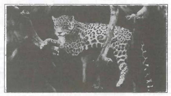
Endangered: Like this jaguar, you depend on the rainforest for survival.

Three of the earth's species vanish every day, primarily due to the destruction of rainforest. If this astounding rate of devastation continues for just ten years, one wildlife species will become extinct every hour.