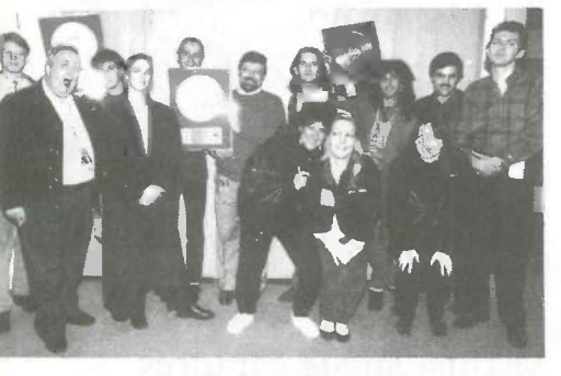
While in Toronto Escape Club received Canadian gold for their Wild Wild West LP from WEA Music Canada crew. The title track, released as a single, is also gold.