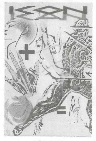
KÖN KAN Move To Move Atlantic - 78-19841-P