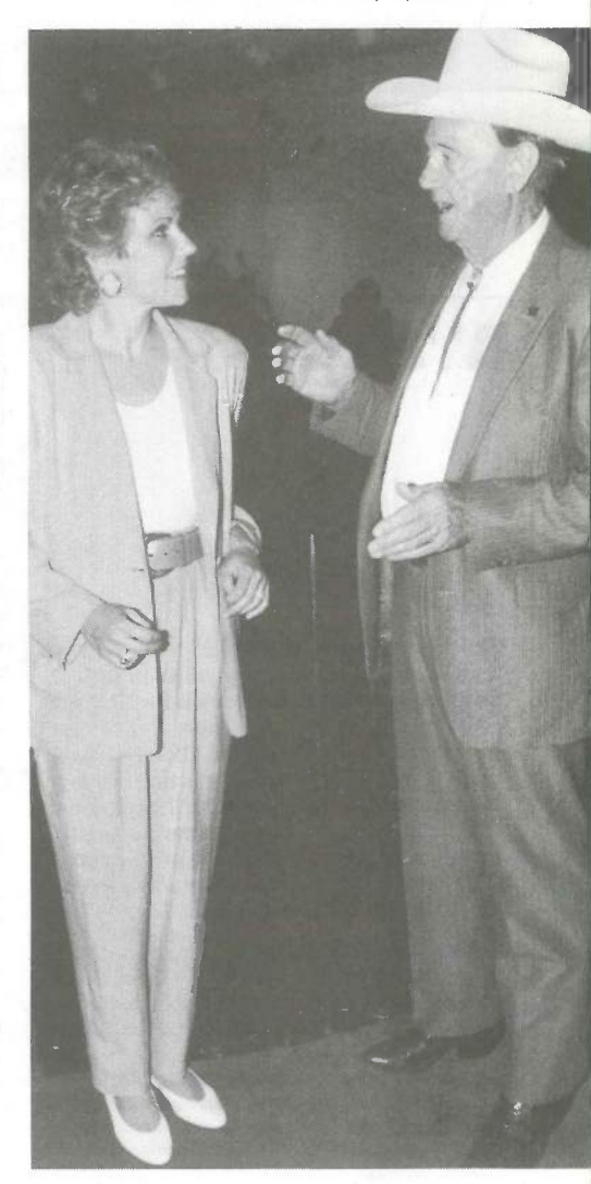
Country music legend Wilf Carter attended Anne Murray's opening night at Toronto's O'Keefe and met the Capitol star backstage.

With the opening of the new store HMV now has forty stores nationally.