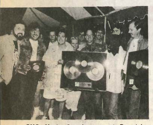
BMG Music Canada crew at Toronto's Kingswood present Jive's Billy Ocean with triple platinum for Suddenly, platinum for Tear Down Those Walls and a gold single for Get Outta My Dreams.

Apparently the Department of Communications has not yet made a decision regarding FACTOR's proposal for an increase in its annual contribution through the Sound Recording Development Program.