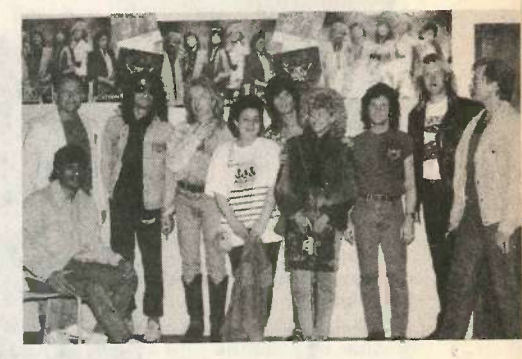
KIS-FM winners meet Aerosmith backstage after their concert in Winnipeg.

Tickets will not be generally available to the public this year. Instead, a special block of tickets may be won by CFNY listeners through various contests and on-air promotions.