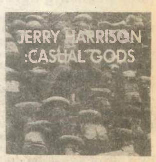
JERRY HARRISON Casual Gods Sire - 92 56631-P