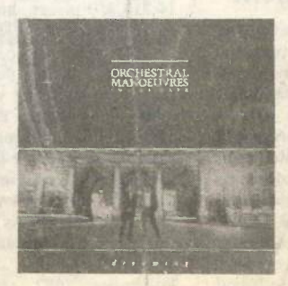
DREAMING OMD Virgin - VS 1421-W