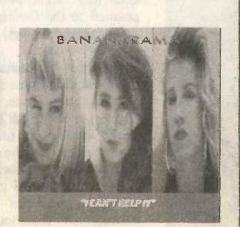
I CAN'T HELP IT Bananarama London - LDS243-Q