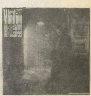
BARRY MANILOW Swing Street Arista - AC-8527-N