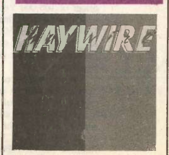
Haywire Attic - AT-365-W