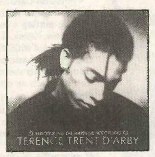
Introducing The Hardline According To Terence Trent D'Arby includes the hit If You Let Me Stay