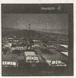
A Momentary Lapse of Reason Pink Floyd includes the hit Learning To Fly