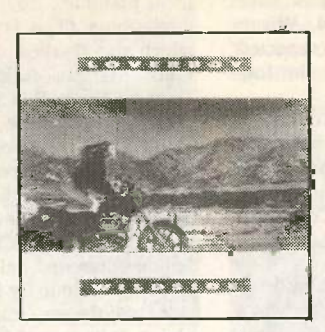
Wildside Loverboy includes the hits Notorious and Love Will Rise Again