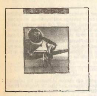
Platinum Blonde includes the hit Contact