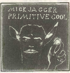
Primitive Cool Mick Jagger includes the hits Throwaway and Let's Work