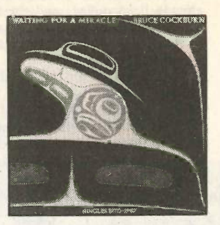
Waiting for a Miracle Bruce Cockburn includes the hits Stolen Land and Waiting For A Miracle