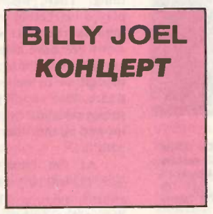
концерт Billy Joel includes the hit Back in the USSR