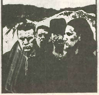
U2 The Joshua Tree Island - ISX1127-J