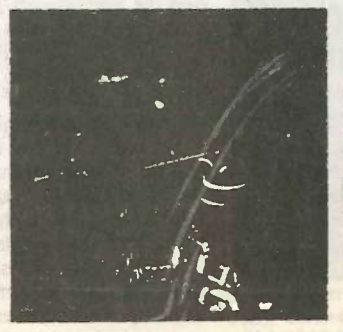
The Truth I.R.S. - IRS-53084-J.