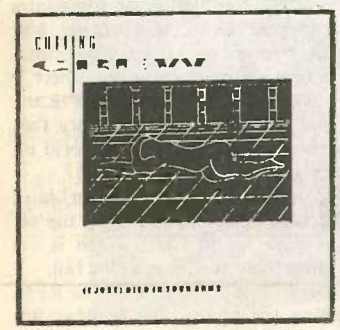
(I Just) DIED IN YOUR ARMS Cutting Crew Siren - VS - 1341-W