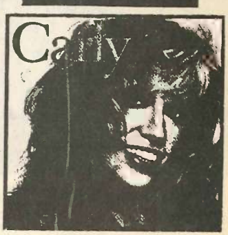
CARLY SIMON Coming Around Again Arista - AC-8443-N