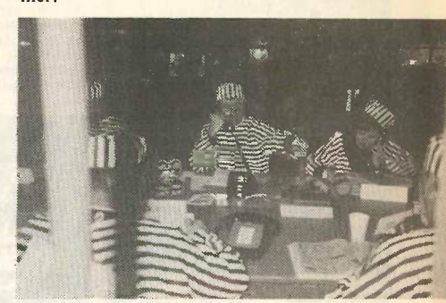
Great Celebrity Lock Up at Nanaimo's CKEG (see RPM Mar. 28/87), which raised $20,000 for the special children of B.C., presented during Variety Club Telethon.

them a discount coupon to Wally World, a new water park opening in London this sum-