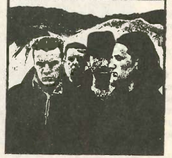
U2 The Joshua Tree Island - ISX1127-J