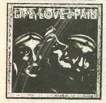
LEAN ON ME Club Nouveau Warner Bros - 92-84307-P