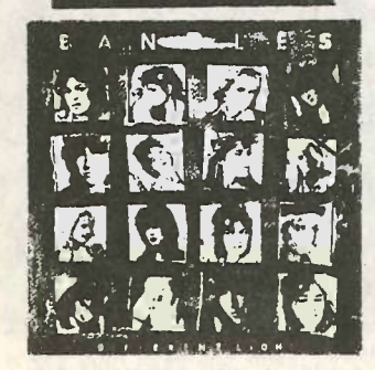
WALK LIKE AN EGYPTIAN Bangles Columbia - 38-06257-H