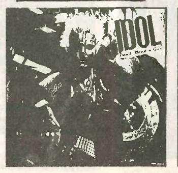
DON'T NEED A GUN Billy Idol Chrysalis -43087-J