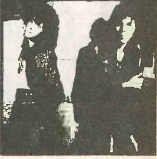
PRICE-SULTON Lights On Columbia - FZ-40540-H