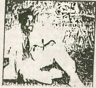
GOING GETS TOUGH Billy Ocean Jive - 114-M