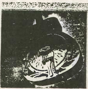
DIRE STRAITS Brothers In Arms Vertigo - VOG-1-3357-Q