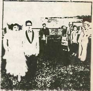
HONEYMOON SUITE The Big Prize WEA - 25-28244-P