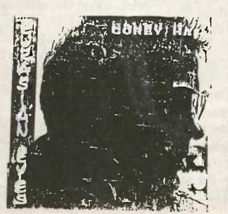
EURASIAN EYES Corey Hart Aquarius - AQ-6022-F