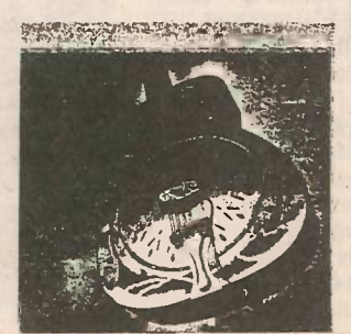
Brothers In Arms Vertigo - VOG-1-3357-Q