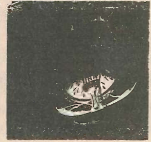
DIRE STRAITS Brothers In Arms Vertigo - VOG-1-3357-Q