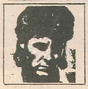
ST. ELMO'S FIRE John Parr Atlantic - 78-95417-P