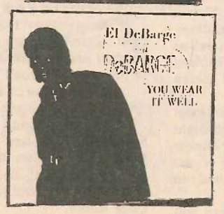
YOU WEAR IT WELL El DeBarge w/DeBarge Gordy - G-1804-M