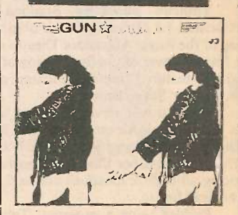
SIMON F Gun Chrysalis - CHSC-41496-J