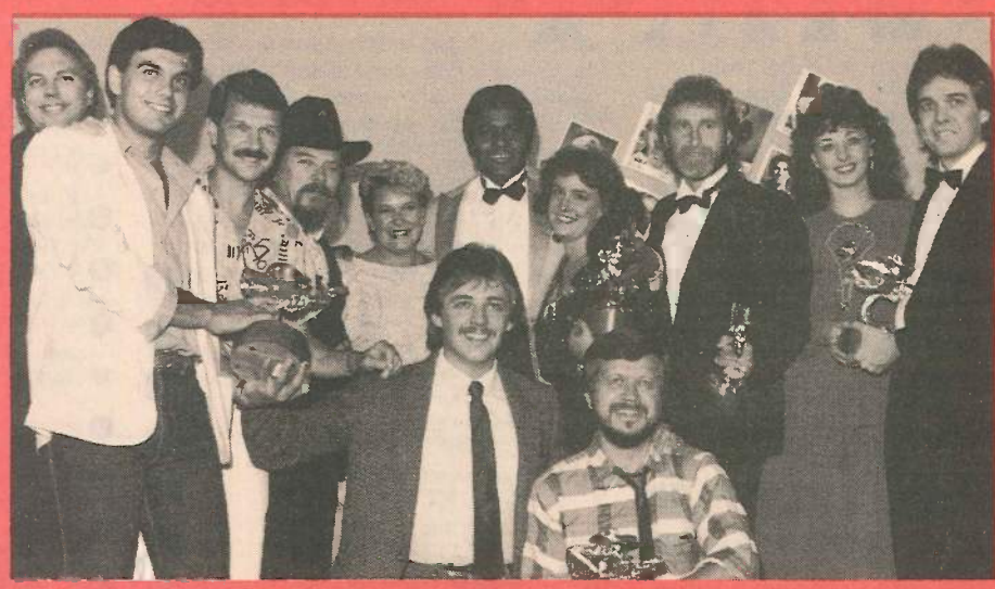
Winners of the 1985 Canadian Country Music Awards with co-host Charley Pride.