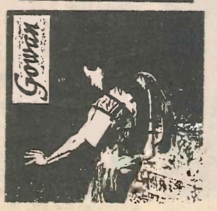
GUERILLA SOLDIER Gowan Columbia - C4-7108-H