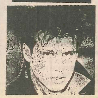
COREY HART Boy In The Box Aquarius - AQ-539-F