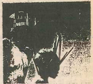
QUADALCANAL DIARY Walking In The Shadow Of The Big Man - Elektra - 96-04291-P