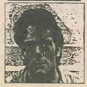
THE POWER OF LOVE Huey Lewis & The News Chrysalis - 42876-J