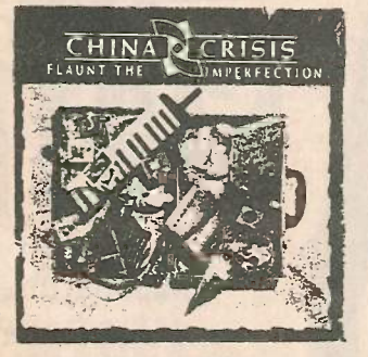
CHINA CRISIS Flaunt The Imperfection Virgin - VL4-2325-Q