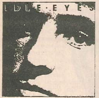
IDLE EYES Idle Eyes WEA - 25-17514-P