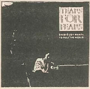
EVERYBODY WANTS TO RULE THE WORLD Tears For Fears Vertigo - SOV-2354-Q