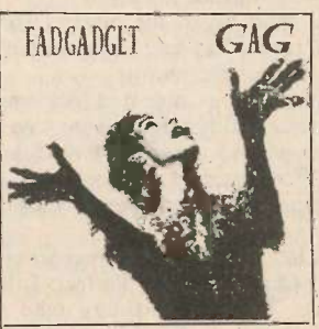
FAD GADGET Gag Sire - STUM-15-P