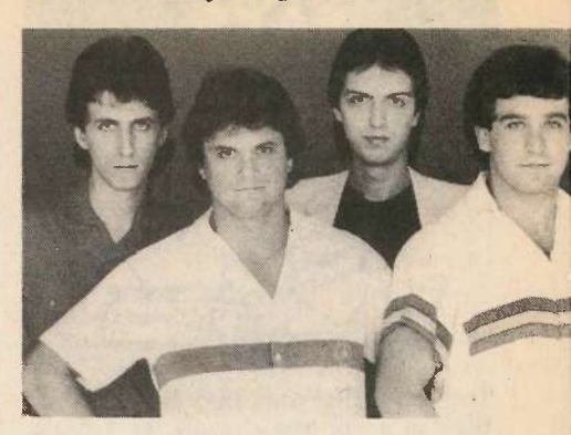
The Montreal-based UZEB

UZEB recently played a four-day engagement at Montreal's Club Soda (May 24), which was part of a 40-day Canadian tour which began in March. The group are slated to play dates in Germany, Switzerland and France in the fall, which will lend a giant promotional boost to their You Be