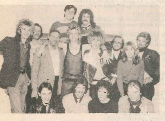
Platinum Blonde at Toronto's Massey Hall with well wishers from CBS Canada and New York. The group's album, Standing in The Dark is moving up the RPM 100.

The Armes single was produced at Sounds Interchange and features a line-up