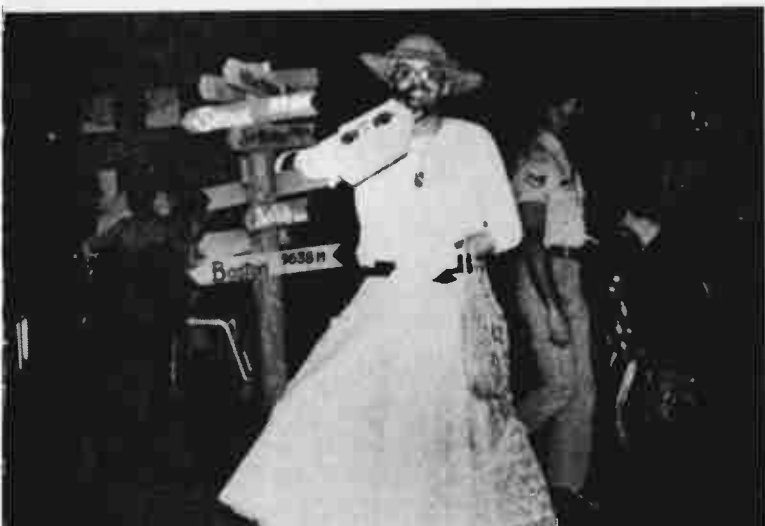
CFUN Radio staged a huge M*A*S*H Bash at Vancouver's Hyatt Regency Ballroom to view the final episode of the series. More than 1000 people dined on ribs and chicken, danced to