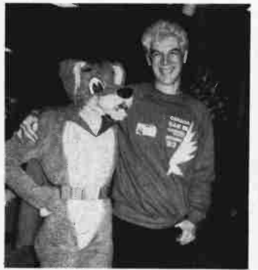
An unknown song writer, publisher and performer (female) with Klees,