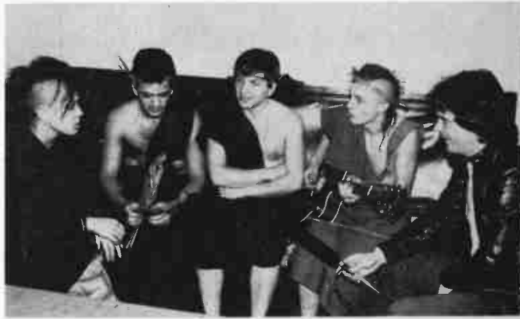
Bow Wow Wow's Dave Barbarossa, Leroy Gorman, Matthew Ashman and Annabella Lwin, being interviewed by CITY-TV's J.D. Roberts. The RCA recording group are promoting their new album, When The Going Gets Tough The Tough Get Going.