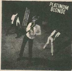
PLATINUM BLONDE Columbia CEP-80084-W