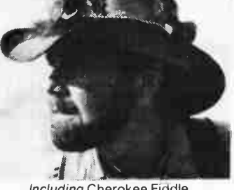
Including Cherokee Fiddle