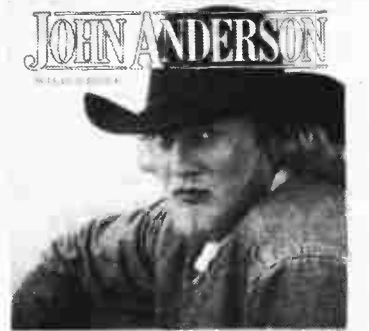
Including Wild & Blue