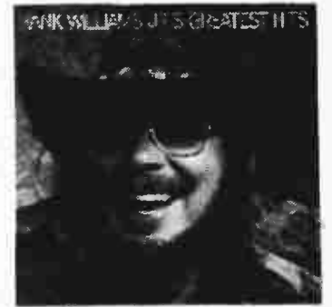
Including The American Dream