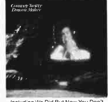
Including We Did But Now You Don't