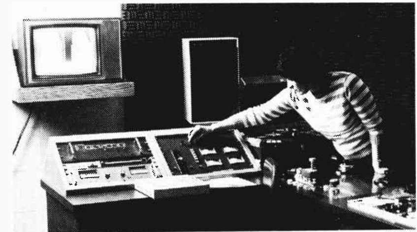
Technician sets up Capitol computer board to test for SDR music cassette sound quality

Of course, home taping will continue and it's estimated to now represent about 15% of a rip-off of the industry, probably more like 20%. You get what you tape however, and that ain't much, once you've curled your ears around the SDR. Capitol will launch a massive campaign to bring these truths home to the home taper, pointing out that what they miss in quality sound, can never, ever be duplicated by blank tape, no matter what it's lined with, or how expensive it is. There's hope for pre-recorded cassettes yet.