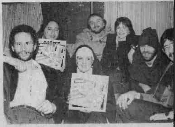
Capitol finally moves into the heart of Toronto with their habits and promotion campaign for The Church and attempt to convert members of the CFTR programming staff