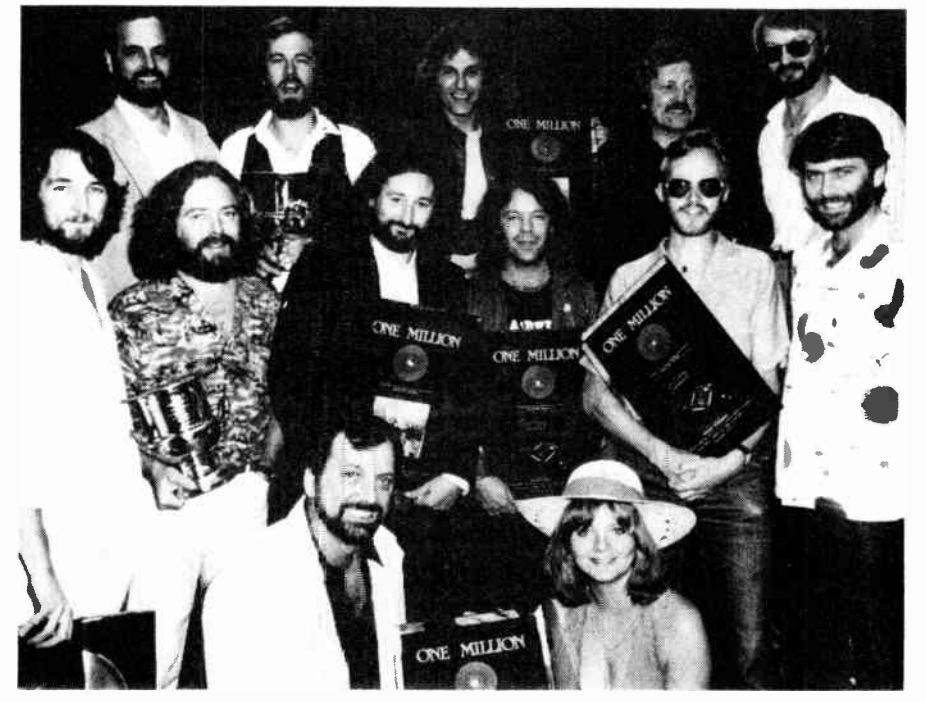
Supertramp joins the rare one million unit award club (only six other albums reached this figure in Canada) for Breakfast In America and Crime Of The Century. The honours were presented to the group in Burbank, California by A&M Canada staffers.